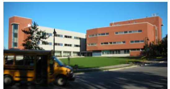
The building in September 2006.