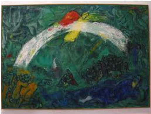
- Moses Receiving the Tablets of the Law