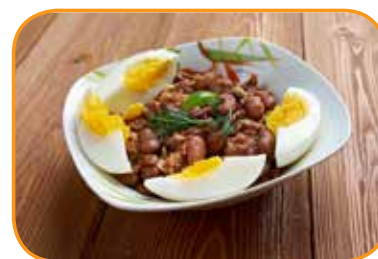
Ful mudammas with eggs