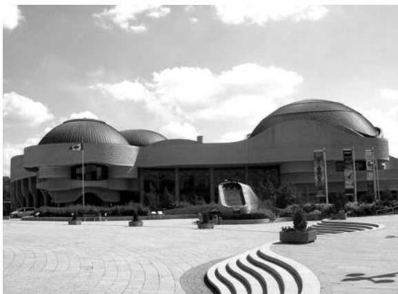
Canadian Museum of Civilization Gatineau, Quebec