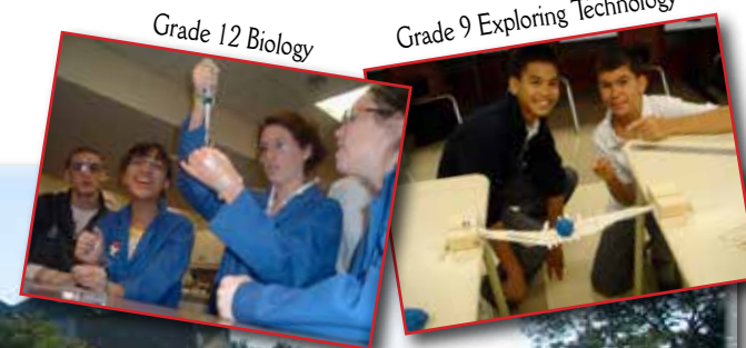
Grade 9 Exploring Technology