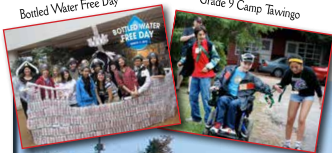
Grade 9 Camp Tawingo