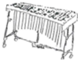
MARIMBA, XYLOPHONE, VIBRAPHONE