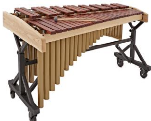
MARIMBA, XYLOPHONE, VIBRAPHONE