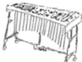
MARIMBA, XYLOPHONE, VIBRAPHONE