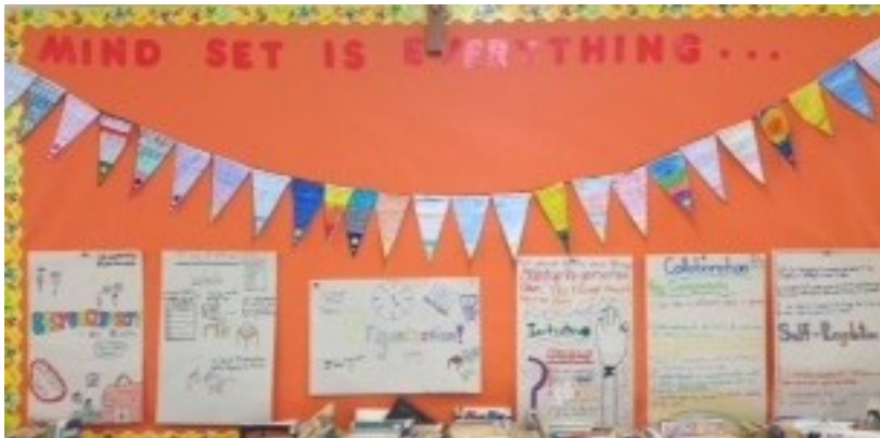
Mind set is everything...Grade 6/7 goals for the school year 2015-2016 and reflections on learning skills.