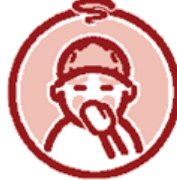
NAUSEA, VOMITING, DIARRHEA