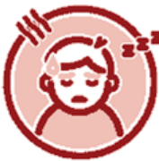
NOT FEELING WELL, TIRED OR SORE MUSCLES