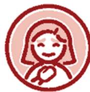
SORE THROAT, TROUBLE SWALLOWING