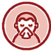
RUNNY NOSE OR RED EYES