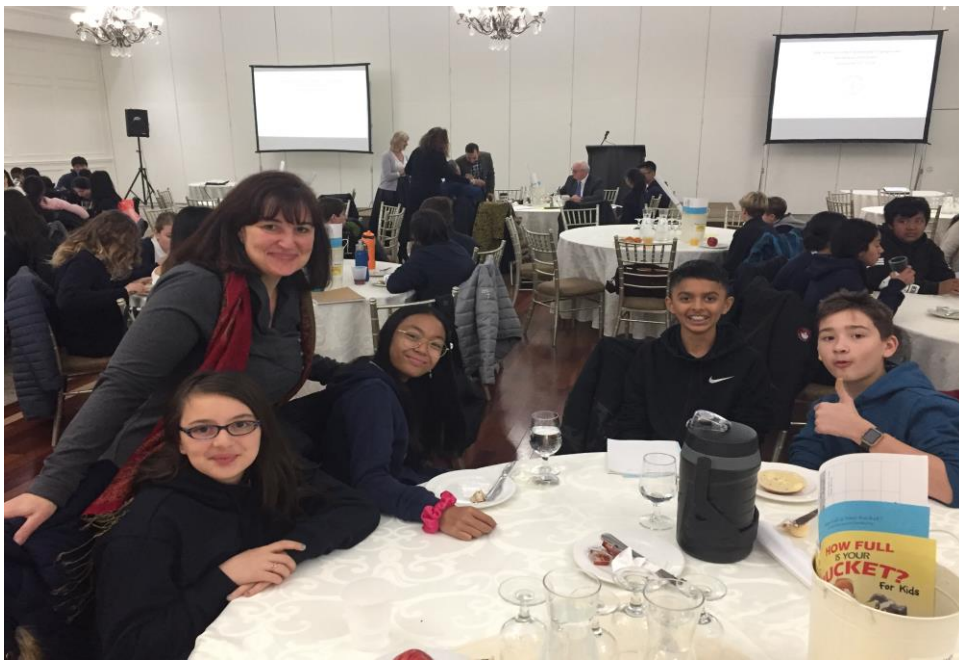
Students and Parents representing St. Elizabeth at the TCDSB Safe School Student Ambassador Symposium on Tuesday 19 th , 2019!