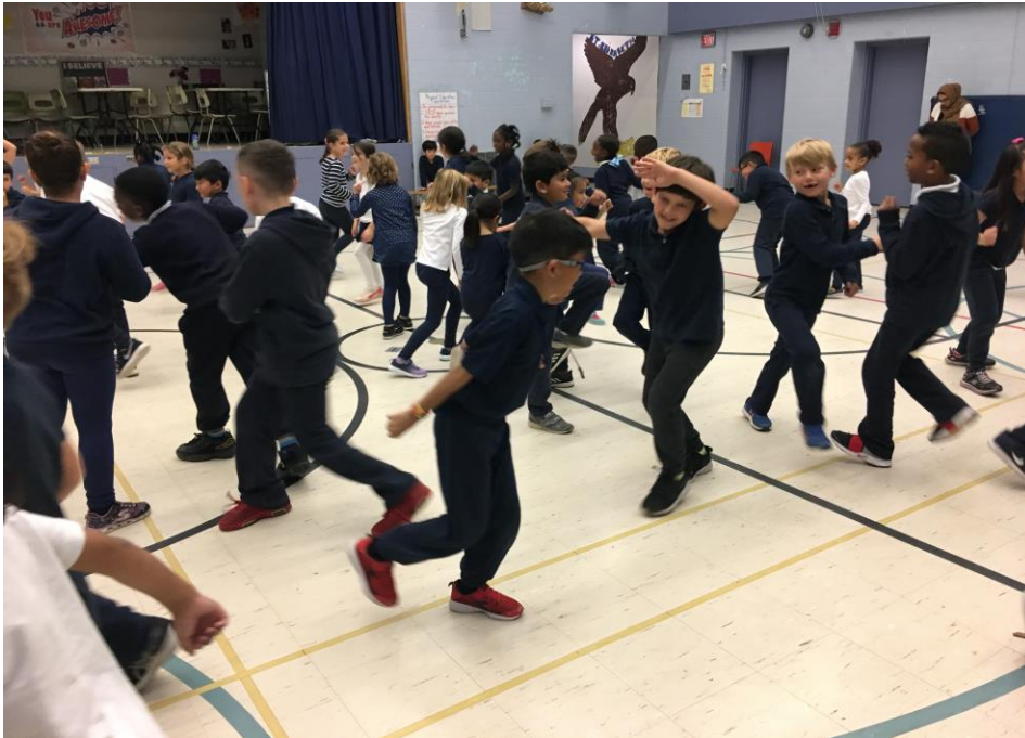
Students participating in the Dance Workshop held in October!