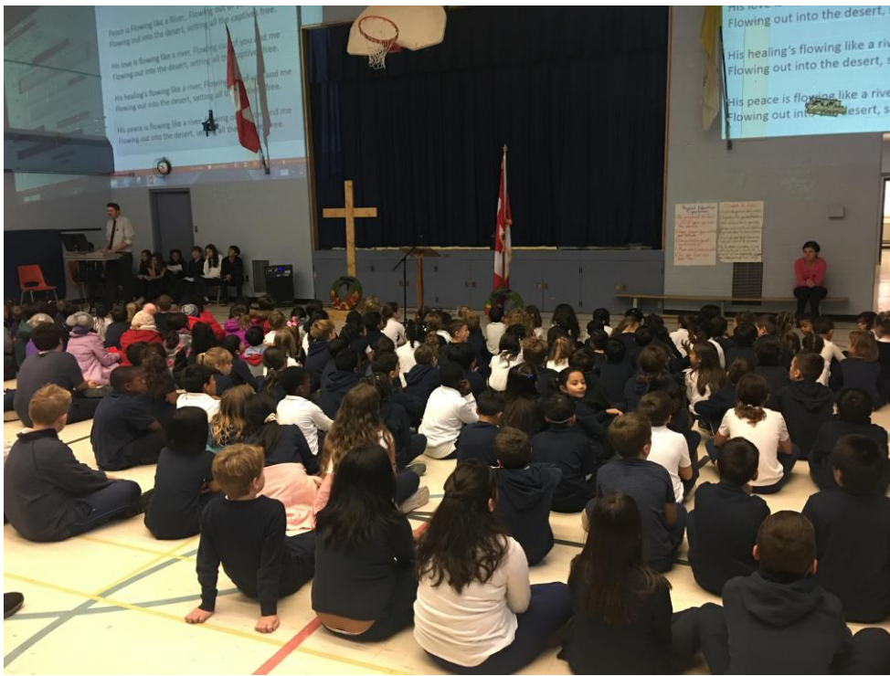
Students being reverent and respectful during Remembrance Day Liturgy, November 11 th .