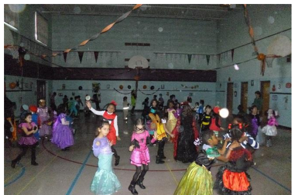
Dancing with the primary grades!