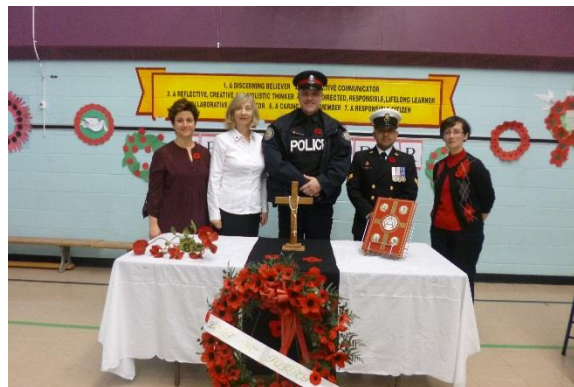
Remembrance Day Ceremony