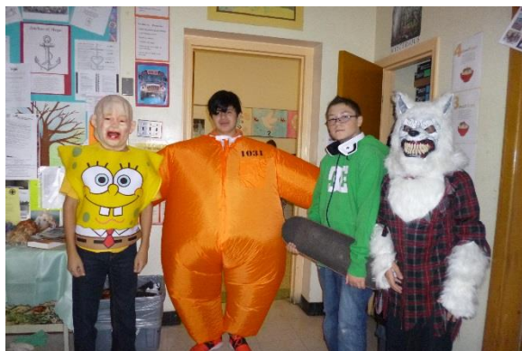
Who are these guys?